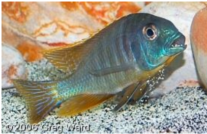
Tramitichromis intermedius - First profile Picture © Greg Ward

There are two profiles posted for Tramitichromis intermedius . The first one shows a species that is mainly blue with yellowish fins. The other looks identical to pictures found on the internet for O. tetrastigma . In this second profile, they state: "This fish trades in the aquarium hobby as Tramitichromis intermedius , yet it is believed to be not so. The blotches are more or less on the middle of the flank, unlike the true intermedius where they occur higher on the body. The snout is also more or less straight instead of rounded like in the true T. intermedius . It is not known if this is a naturally occurring fish, or the result of an accidental hybridization."