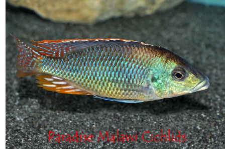
Otopharynx tetrastigma

It all started last January 2010, when someone posted 'Fry for sale' in the OVAS Classifieds. Scanning the list of the sellers' available fish, I took immediate notice of the 'White Tail' (Pseudotropheus) Acei and 'Ngara Flametail Peacocks' (Aulonocara Stuartgranti). I had a few of the regular 'yellow tail' Acei species and thought the black variety could be a nice addition to my 135 gallon tank. As for the Ngara Flametails, I had one male and was eager to have a few more of this spectacular looking cichlid. And then my eye caught the listing: Otopharynx Tetrastigma. I had never heard of this one before. What did it look like? Was it anything like my mature Yellow Blaze Lithobates? I had to research this species.