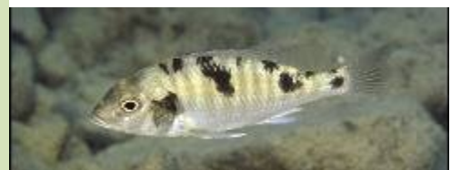
Female pictured at Cobwe, Mozambique