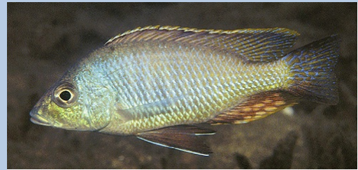
Otopharynx tetrastigma - Male pictured at Thumbi East Island, Malawi.

As part of the Otopharynx genus, it is characterized by the presence of three distinct spots that do not extend past the dorsum (or lateral line), and by moderately stout bicuspid oral jaw teeth in its outer series. While the spots may be faded on a male in breeding dress, they are visible on females and juveniles.