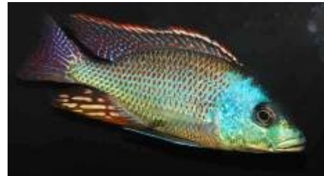
' Tramitichromis intermedius ' First Place Winner, 2008 Minnesota Aquarium Society Tropical Fish Show Show entry by Bob Randall

A quick Google search provided some stunning pictures. Wow! What an attractive fish! Its head has a nice green sheen, its body covered in various shades of green, blue, and yellow scales, and all of it crowned by red and white dorsal, caudal and anal fins. But it seemed somewhat familiar. Wasn't that the fish that won a prize at a recent tropical fish convention? I traced back the link in my browser history: 2008 Minnesota Aquarium Society Tropical Fish Show Results. My suspicion was correct - it was the first place winner in the Lake Malawi Haplochromis category. But, it was described as Tramitichromis intermedius ? Confused, I searched some more about both these species. It appeared as though there was some controversy in the trade, but more about this later.