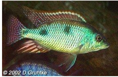
Tramitichromis intermedius - Second profile