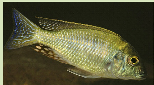
Tramitichromis intermedius - Male in aquaria

T. intermedius is normally found singly or in small groups foraging over sediment-covered sand in shallow water. It feeds on insect larvae and other soft invertebrates. T. intermedius has a lake-wide distribution. Breeding males defend small pits in the mud or sand as territory.