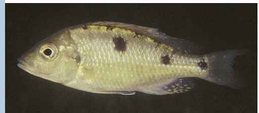
Female pictured at Thumbi East Island, Malawi

Tramitichromis intermedius is a little-known species that was originally described under the name of Lethrinops intermedius by Trewavas in 1935. Its maximum total length is approximately 14 cm (5½ inches).