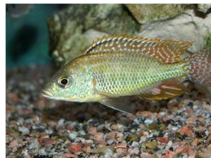
Tramitichromis sp. "Unknown" this species is often sold as Tramitichromis intermedius , but it is not the true intermedius Dave Schumacher