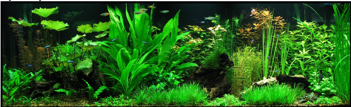
Patrick S With a full tank shot of a 180G planted tropical community tank