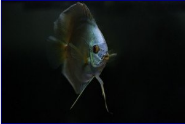
fischkopp with a shot of a young adult male Blue Diamond discus.