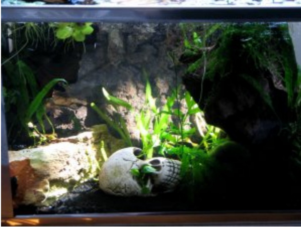
Anja Krebber (yours truly) with a full tank shot of a 5G planted tank housing assassin snails.