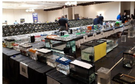
The CAOAC show room. In the front is the CAOAC show tables, in the background the Trans Canada Guppy show