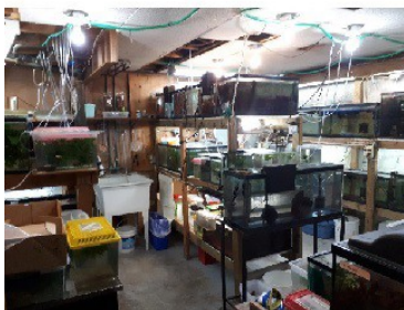
Brian Glazier's fishroom