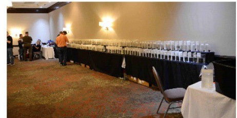
Canadian Betta Breeder's show