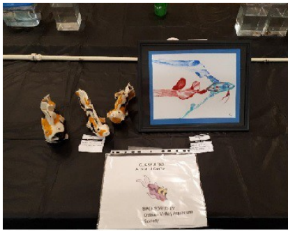
Arts and Crafts Category - Sponsored by OVAS