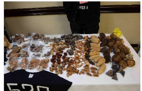
520 Buco botanicals table