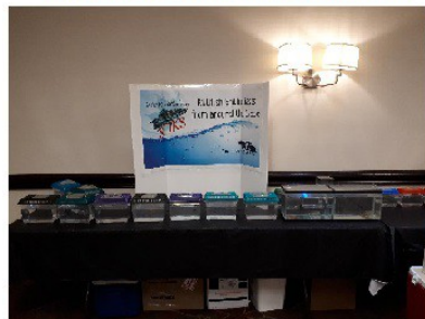
Southern Ontario Killifish Society Show